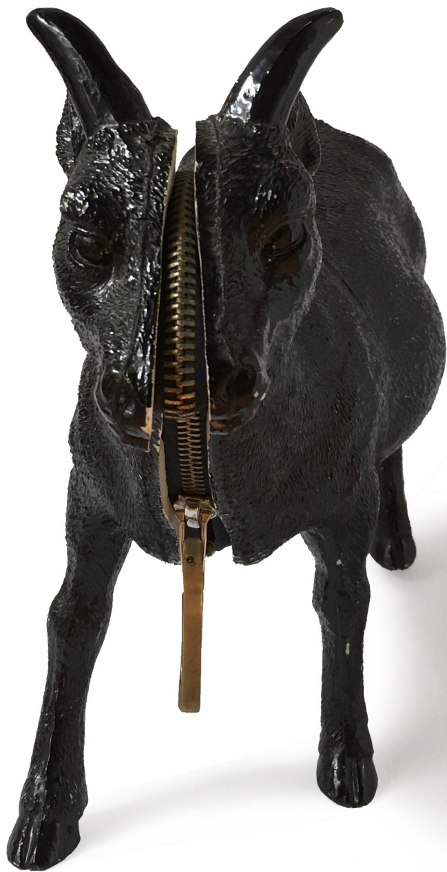
Goat Clutch. Plastic, zipper, cotton lining.