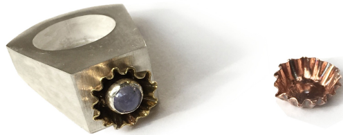
Bonbon Ring . Silver, ebony, tanzanite. Exchangeable base in copper or bronze.