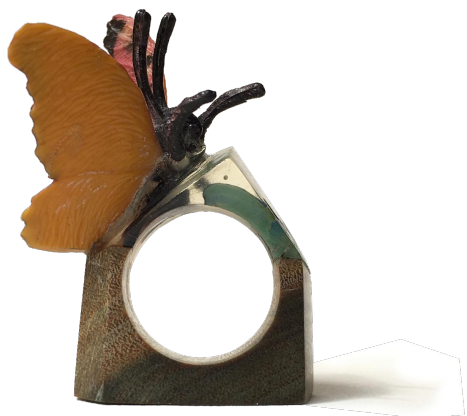
Wooden Butterfly Poem. Resin, rubber, palo santo.