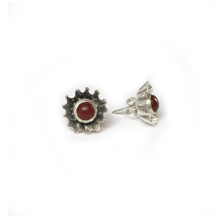
Bonbon earrings . Silver, ebony, garnet. Fru-fru mechanism with removable base.