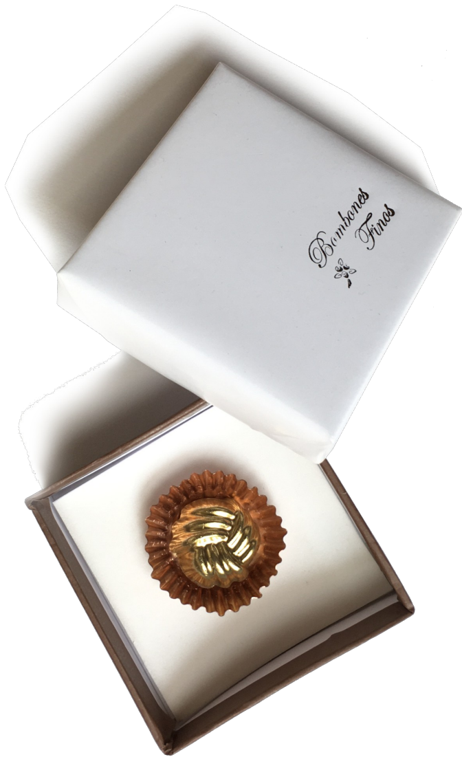
Bonbon Brooch . Bronze, copper.