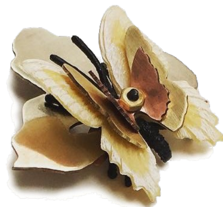
Fluttering Brooch. Bronze, copper, rubber.