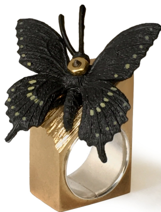
Metal Butterfly Poem. Bronze, rubber, silver.