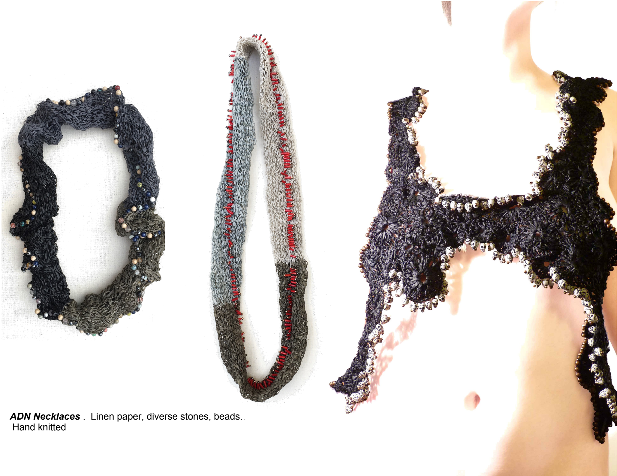
ADN Necklaces . Linen paper, diverse stones, beads. Hand knitted