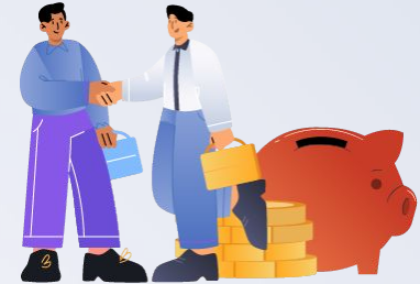
Mutual Funds/Pension Funds