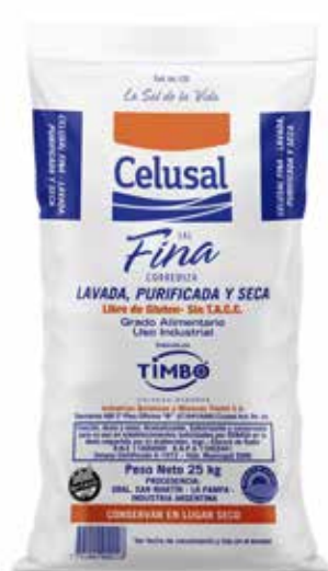
Fine table salt

Humidity: 0.1% max. Sodium sulfate: 0.7% max. Calcium chloride + magnesium chloride: 0.5% Insoluble residues: 0.03% max.