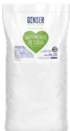
Genser Classic 66% less sodium

Humidity: 2% max. Sodium sulfate: 0.7 % max. Calcium chloride + magnesium chloride: 0.5%