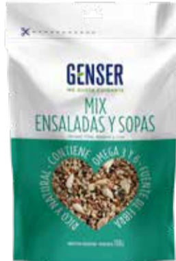
Salads and Soups