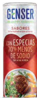
Saltshaker x 90 grs.

It is a salt mix with 70% less sodium, a touch of aromatic herbs and a selection of spices.