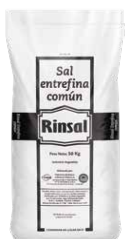
Common fine salt

Humidity: 5% max. Sodium sulfate: 1.4% max. Calcium chloride + magnesium chloride: 1% Insoluble residues: 0.5% max.