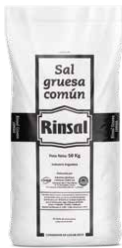
Common coarse salt

Bags x 25 kg and 50 kg Unit of Sale (UoS): Arlog Pallet: 48 bags x 25 kg/30 bags x 50 kg