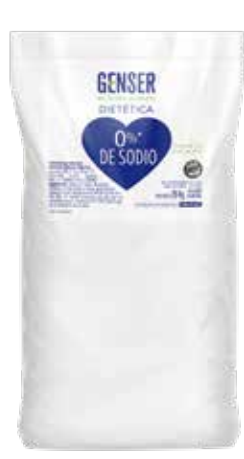
Genser Diet 0% sodium

Bags x 25 kg UoS: Arlog Pallet: 40 bags x 25 kg