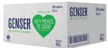
Box x 500 sachets x 1 g