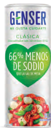
Saltshaker x 300 g

Unit of Sale (UoS): Arlog pallet: 360 trays x 16 units