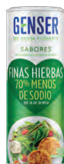
Saltshaker x 90 g