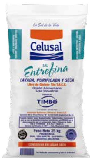
Medium grain salt

Bags x 25 kg UoS: Arlog Pallet: 48 bags x 25 kg